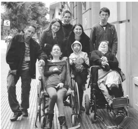
Latin American Meeting

organized by the Fundación FOP with the support of the International FOP Association was held May 12th to the 15th in Buenos Aires, Argentina.