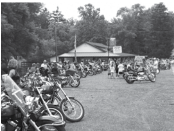
Over 100 Motorcyclists Participated!

The first annual Ride for Joshua’s Future of Promises was held on August 6th. It was a successful day and the heavy rain held off until the bikers completed their ride. A little over one hundred people registered for the ride. It was quite a sight to see the bikes lined up and getting ready to