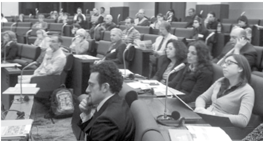
Italian FOP Conference

In the third day the focus was moved onto the Italian FOP Association activity performed in the last year, with a